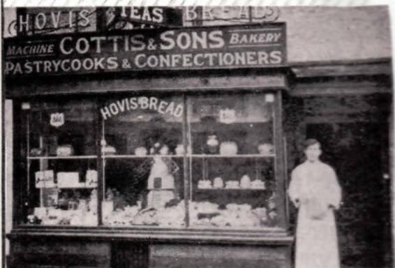
This photograph of Cottis bakery shop was taken in 1921 when the building was double-fronted. It was originally a 17th century building, timber framed and weatherboarded. In the 19th century the front was bricked over. The bay window shop shown here was on the north side of the building. The picture was taken just before Christmas with Christmas cakes and a large windmill made for the festive season. In 1922 the wall between the shop and the tea room was removed. The man standing at the door with the bag of yeast is one of the bakery employees.